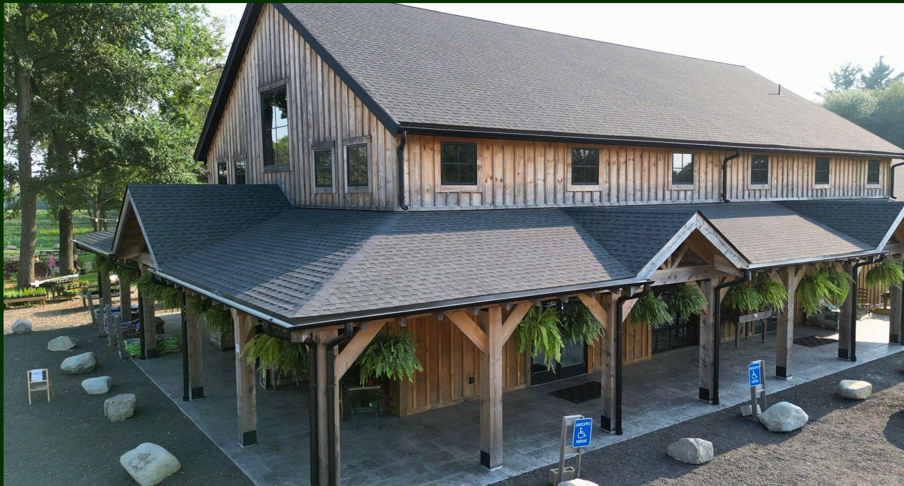
Langwater Farm Store (2022)