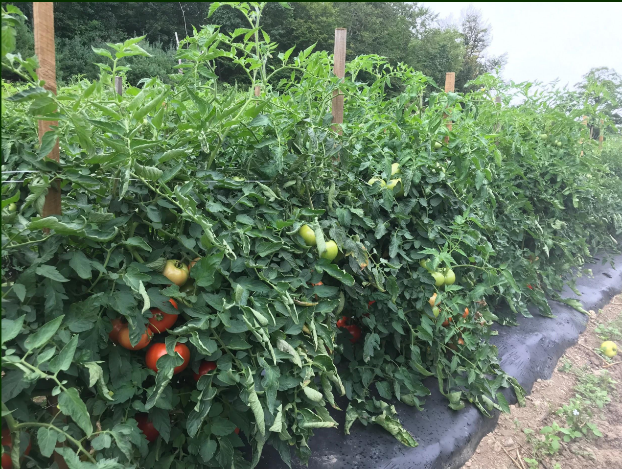
Healthy tomato foliage