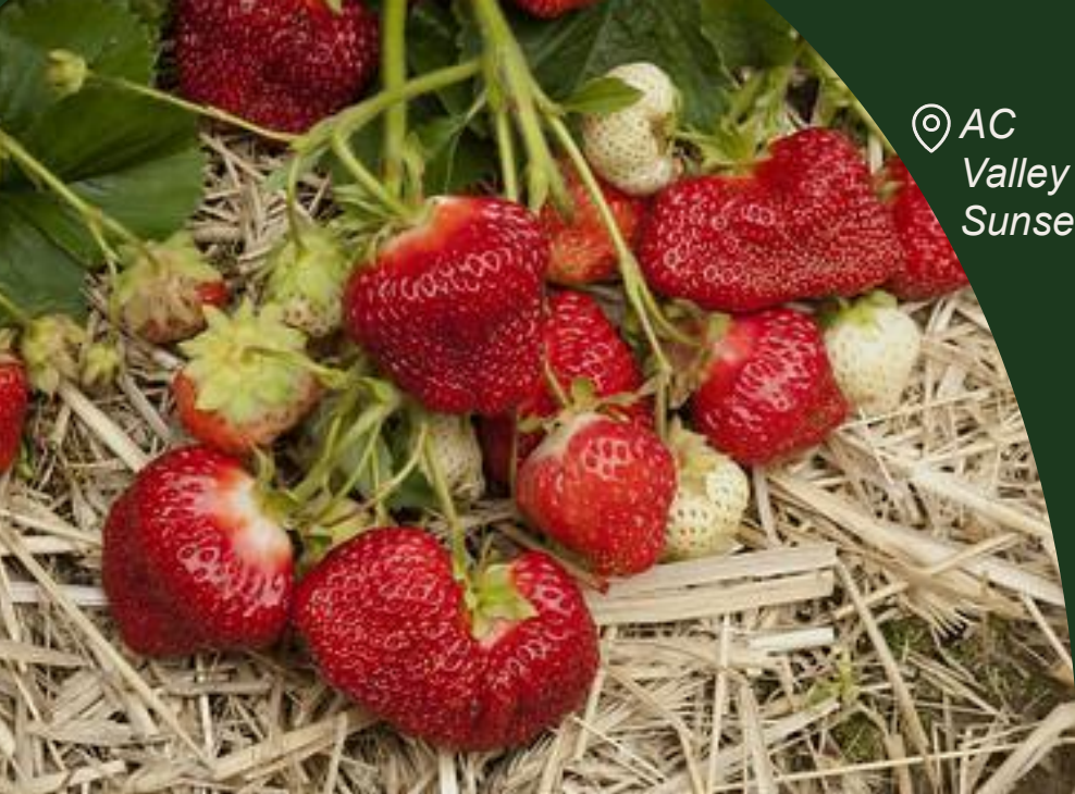
📍 AC Valley Sunset