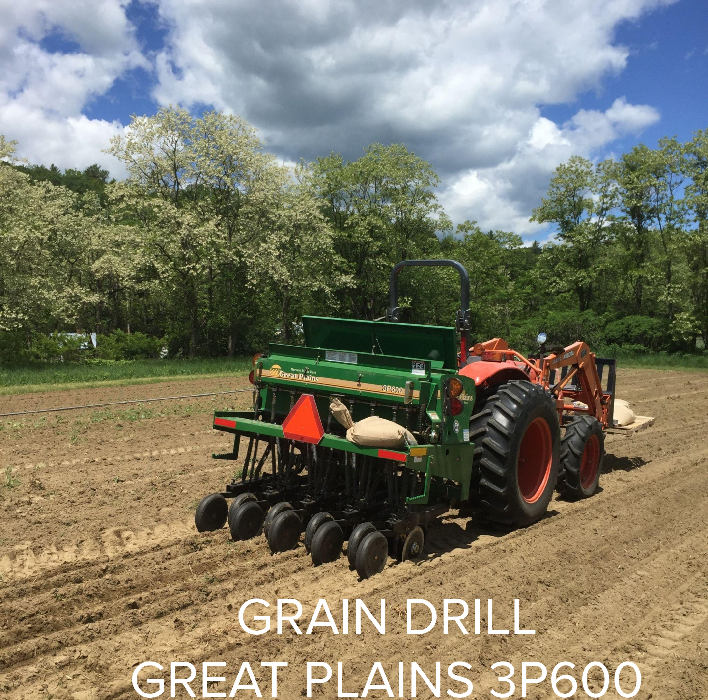
GRAIN DRILL GREAT PLAINS 3P600