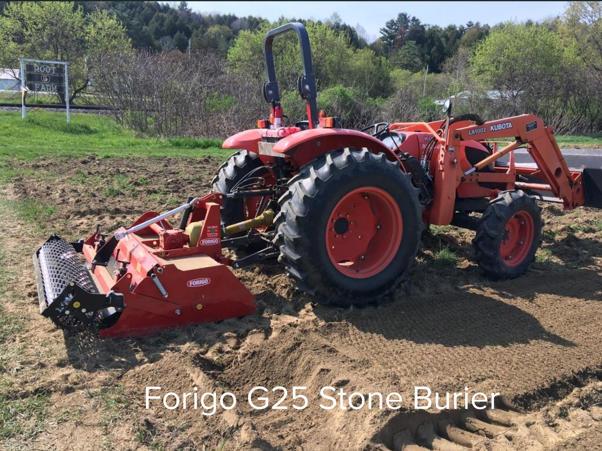
Forigo G25 Stone Burier