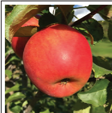
Figure 1. Crimson® Gold (Svatava Cv.) grown at UMass Cold Spring Orchards

14 when picked before becoming over-mature. Starch-index readings are variable but should be in the 4-7 range about October 1, the approximate recommended harvest date, just before Golden Delicious. Fruit flavor is best described as complex with both high sugar and acidity. It is admittedly not for everybody, but for those who appreciate a complex flavor. Fruit flesh is green-white, medium texture, crisp-melting, and sweet-tart. Skin is a bit chewy. Tree