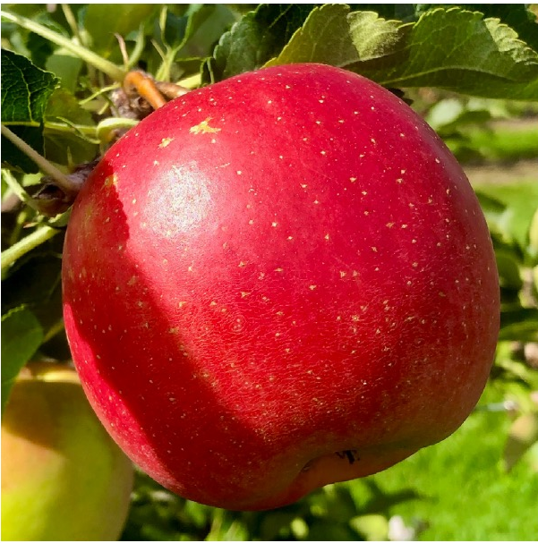
Figure 3. RubyRush - UMass Cold Spring Orchard.